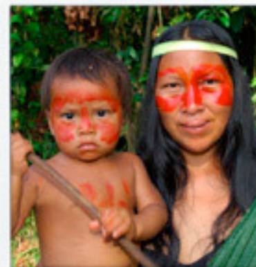
Tagaeri mother and child

PS 3: Norway’s Oil Legacy fund contains $363 billion.